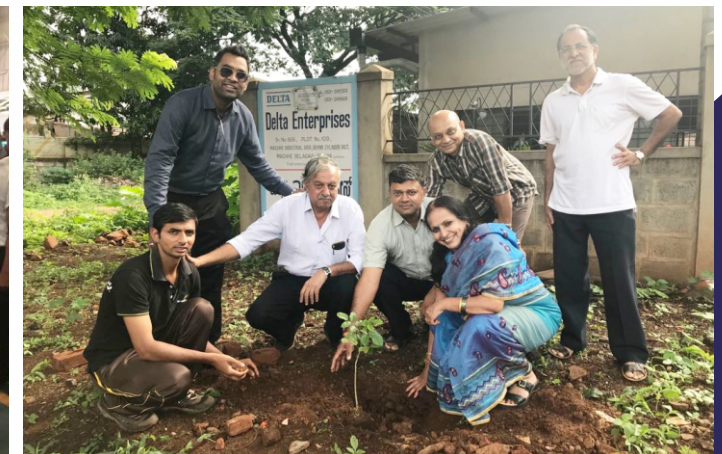
With his colleagues from the industry in a tree plantation drive at Macche Industrial area, Belagavi.