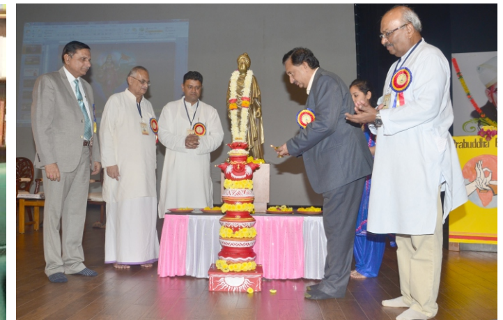
Participating in 'STEP 2016' part of Prabuddha Bharat program in Belagavi.