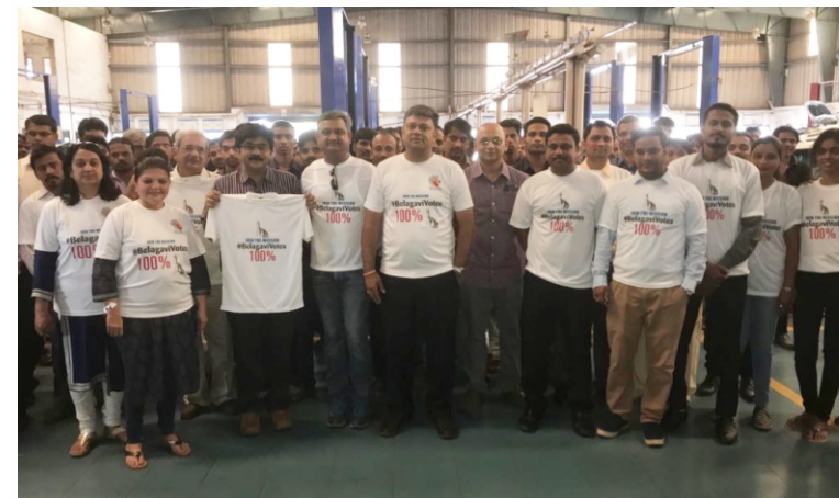
Promoting the importance of voting and creating awareness in "Belagavi Votes 100%" campaign.