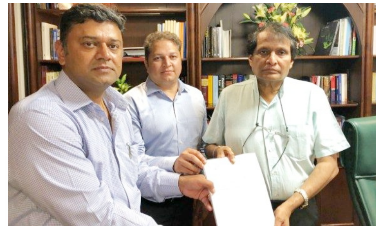
Meeting Union Civil Aviation Minister, Mr. Suresh Prabhu in New Delhi and handing over a memorandum for resumption of flight services from Belagavi airport.