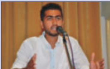
24 -Apr- 2014