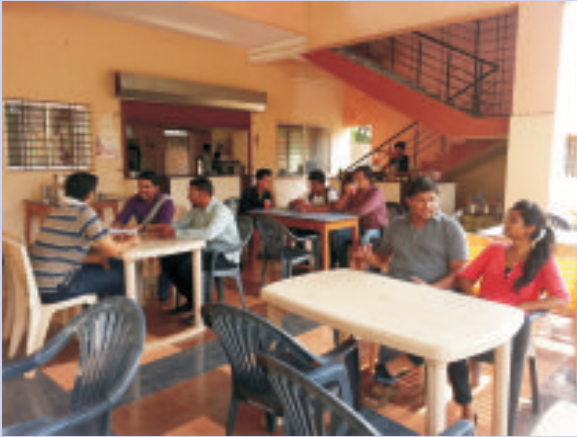
The cafeteria @ IMER

A new contractor has been appointed to provide a better food experience to our students and staff. Equipment costing approx. Rs. 2 Lakhs was purchased and provided to reduce the burden on the contractor and to be able to provide food at an affordable price.