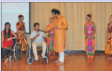
22 -Jan -2014