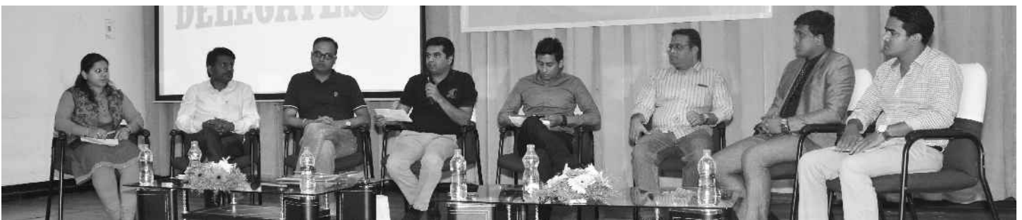
Panel - Voice of Retailers & Service Providers

The conclave was attended by around 100 retailers from in and around, Belagavi, Hubli and Dharwar. A majority of the attendees were very appreciative of KLS IMER’s efforts in dreaming up and executing a Conclave on this topical and disruptive business issue.