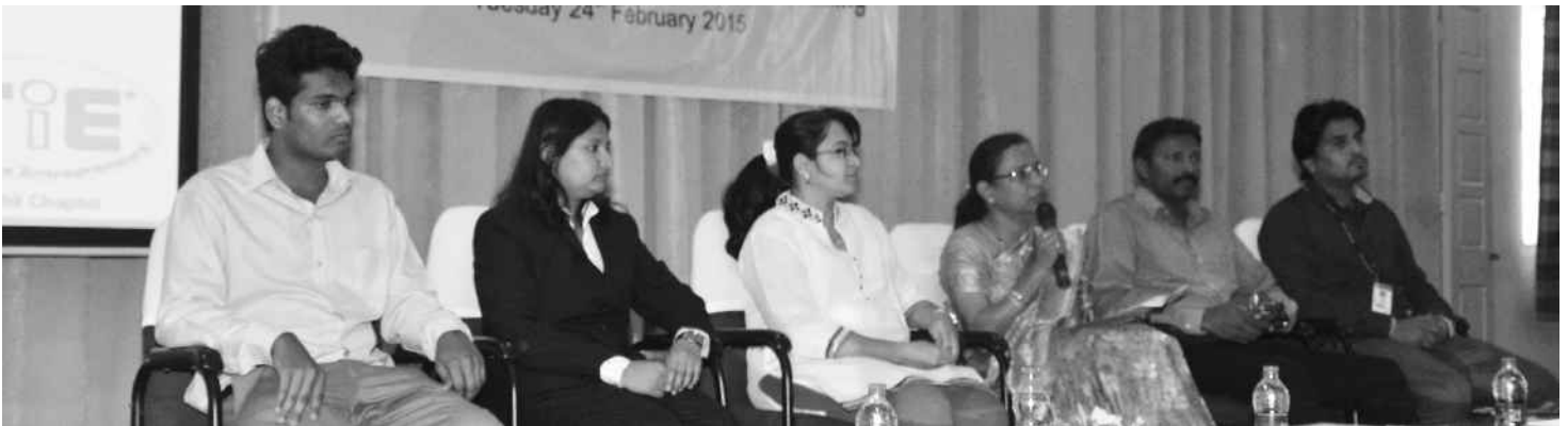
Panel - Voice of Consumers