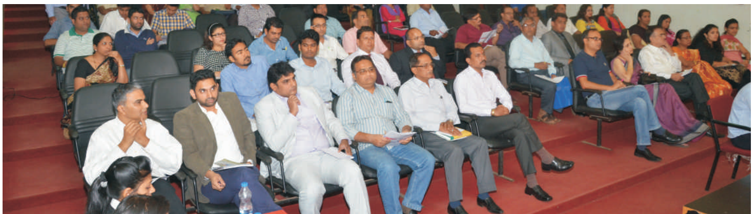
100 + Retailers in attendance